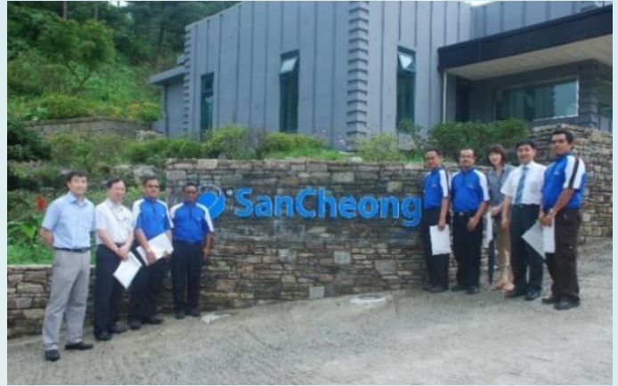
Figure 3.6 Visit to Military Gas Mask Manufacturers in South Korea