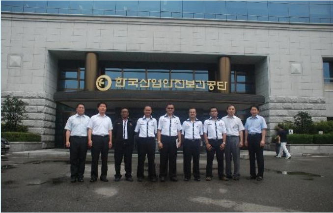
Figure 3.5 Study Visit to KOSHA, South Korea