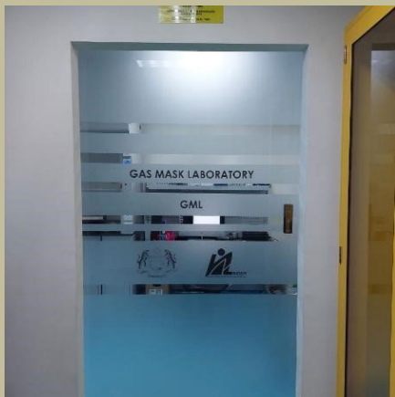
Figure 3.0 Gas Mask Laboratory Entrance