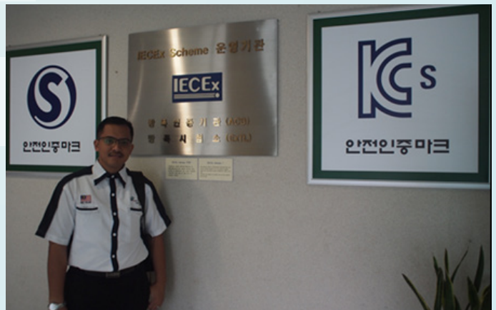
Figure 3.10 KOSHA PPE Certification Centre