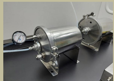
Figure 3.4 The Testing Chamber