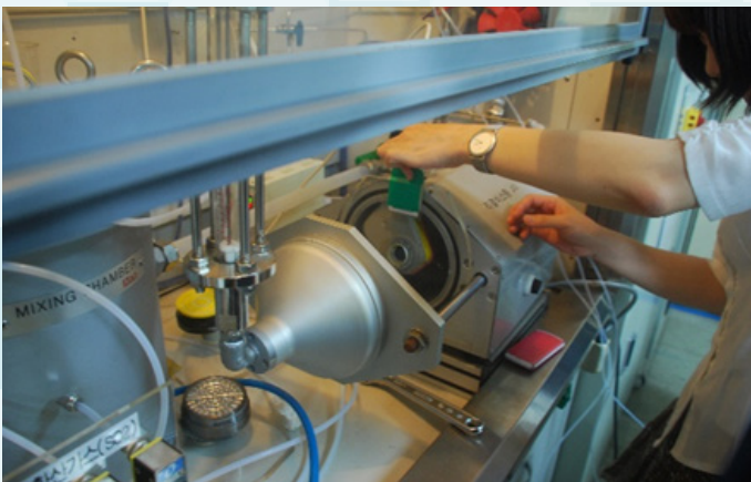
Figure 3.9 KOSHA Gas Mask Testing Facility