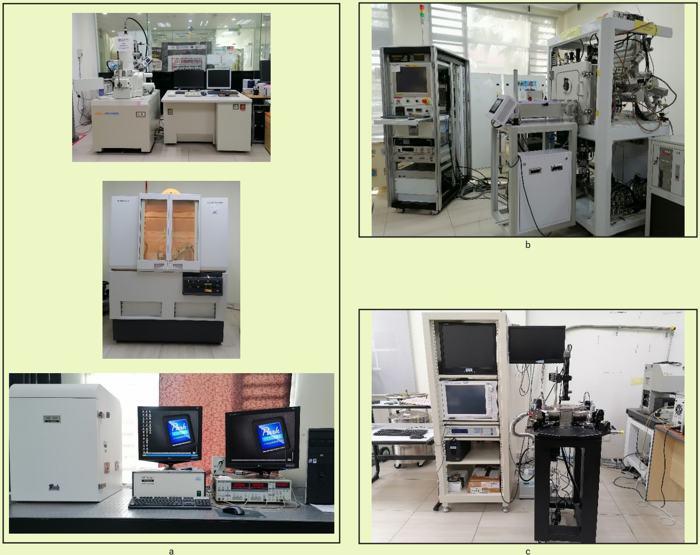
Fig 1: Equipment for (a) Material Analysis, (b) Electrical Analysis and (c) Nano Processing

The 4 Fabrication Laboratories and 2 Computer Laboratories are used by UTHM students from all education levels including Bachelor, Master and Doctor of Philosophy to carry out their research projects. The fabrication laboratory is equipped with various equipment such as RF & DC Sputtering, microscope, centrifuge, vacuum oven, ultrasonic cleaner, fume chamber, and others. The operation of these fabrication laboratories is regularly audited by the UTHM Occupational Safety and Health (OSHE) department to ensure that it meets the strict safety standards. A total of 6 student workspaces have been prepared to provide a convenient and work-friendly environment to enhance productivity and determination of research activities. Undergraduate and postgraduate students pursuing studies here are composed of local and international students such as Indonesia, India, Saudi Arabia, Yemen and Iraq. Currently, MiNT-SRC has been actively involved in various research fields locally or internationally through research grants, consultancy, community service, student mobility, publications and many other activities with strong collaboration among universities, industries and community partners.