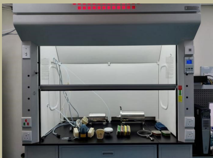
Figure 3.1 Gas Testing Chamber