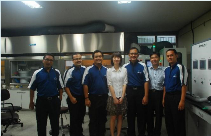
Figure 3.7 KOSHA Gas Mask Experts with the NIOSH Study Visit Team