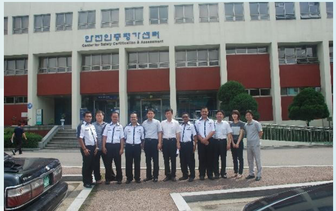
Figure 3.8 KOSHA Directors with NIOSH Study Visit Members